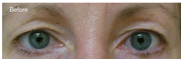
5 days post laser AceLift™ For Eyes, upper eyelids only

Under-eye hollows, wrinkles, and sagging can also add years to your appearance and make you look perennially tired. Once again, there is no one-size-fits-all treatment for improving the appearance of the under-eye area. Dr. Sarnoff analyzes each person individually to identify the lower lid problem and determine the best approach for revitalization. To improve the appearance of deep tear